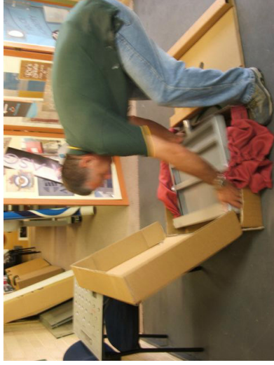
Place Top (C) gently into box