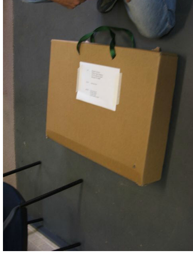
Close the box & return to: Wilson Sign Solutions 30 westchester Road MALAGA WA 6090

Any damages to the Stand or the box will attract a fee