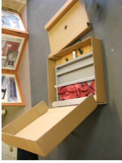
Fold cutains into top section