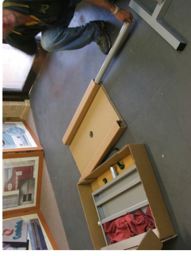
Insert Pole (B) into cardboard slot