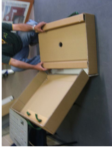
Place cardboard slot into box facing up